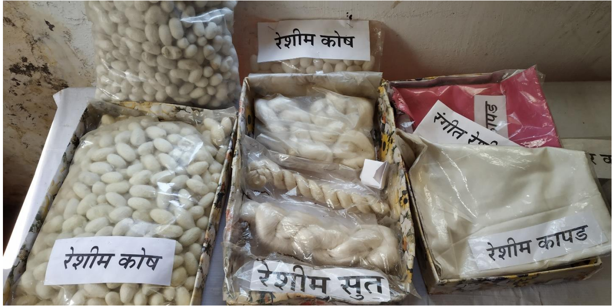
Sericulture Silk, coccon