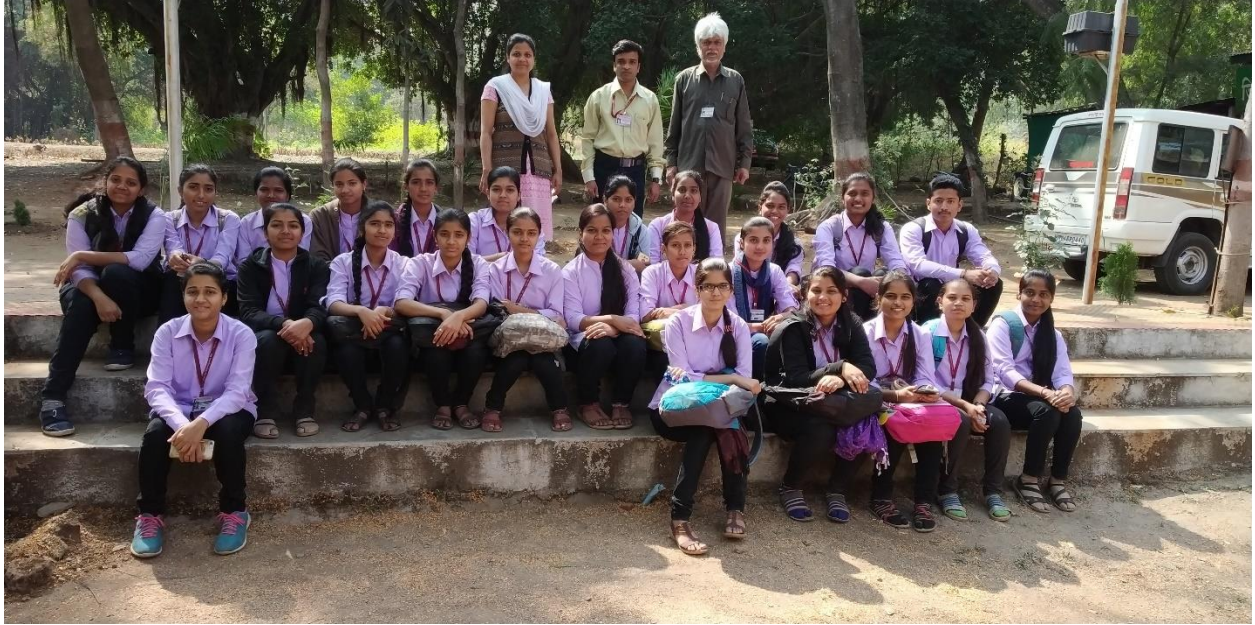
Visit to Sericulture Centre Wai