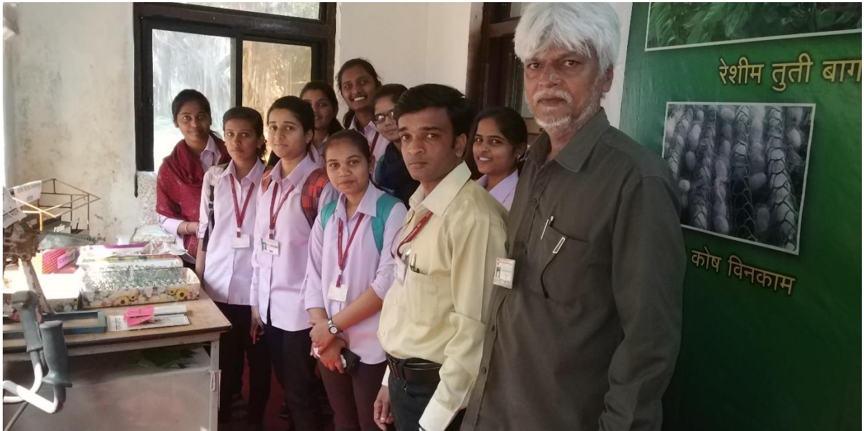
Students observing sericulture tools